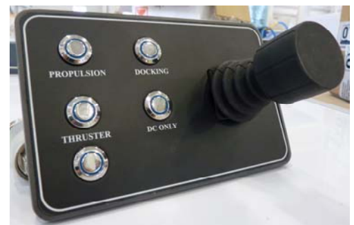
Helm joy stick panel

Horizon worked closely with its client and their customer, the boat builder, in Maine USA, to manufacture install and commission the system.