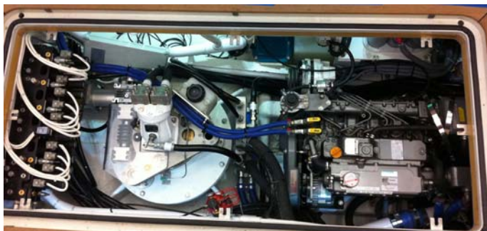
Right: Top of the rotating sail leg and Yanmar engine in the machinery space, also visible are the hydraulic manifold blocks.

The yachts base during winter time, is in the state of Maine, so in order to facilitate easy routine maintenance and program upgrades a remote access system was installed by Horizon to ensure the systems performance through every stage of its life cycle.